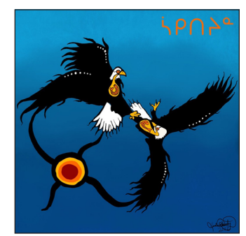
Art by Hadassa Greensky

the exhibition as well as proposals to offer classes and workshops. Entry deadline: August 21, 2023