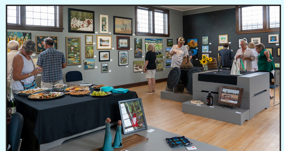
Member Show Opening 2022