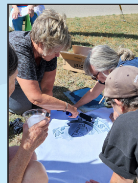
Manhole Cover Printing Workshop